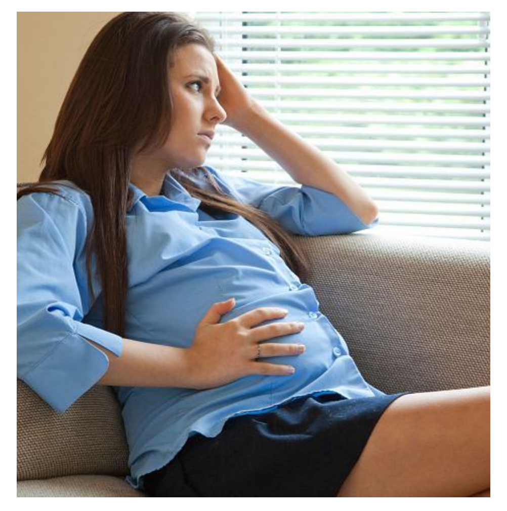
Teen mother: Solent NHS Trust said the scheme had cut under-16 pregnancies

Although teenage pregnancy rates in Britain are now beginning to fall, they are still twice as high as those in France and Germany and five times the rate in the Netherlands.