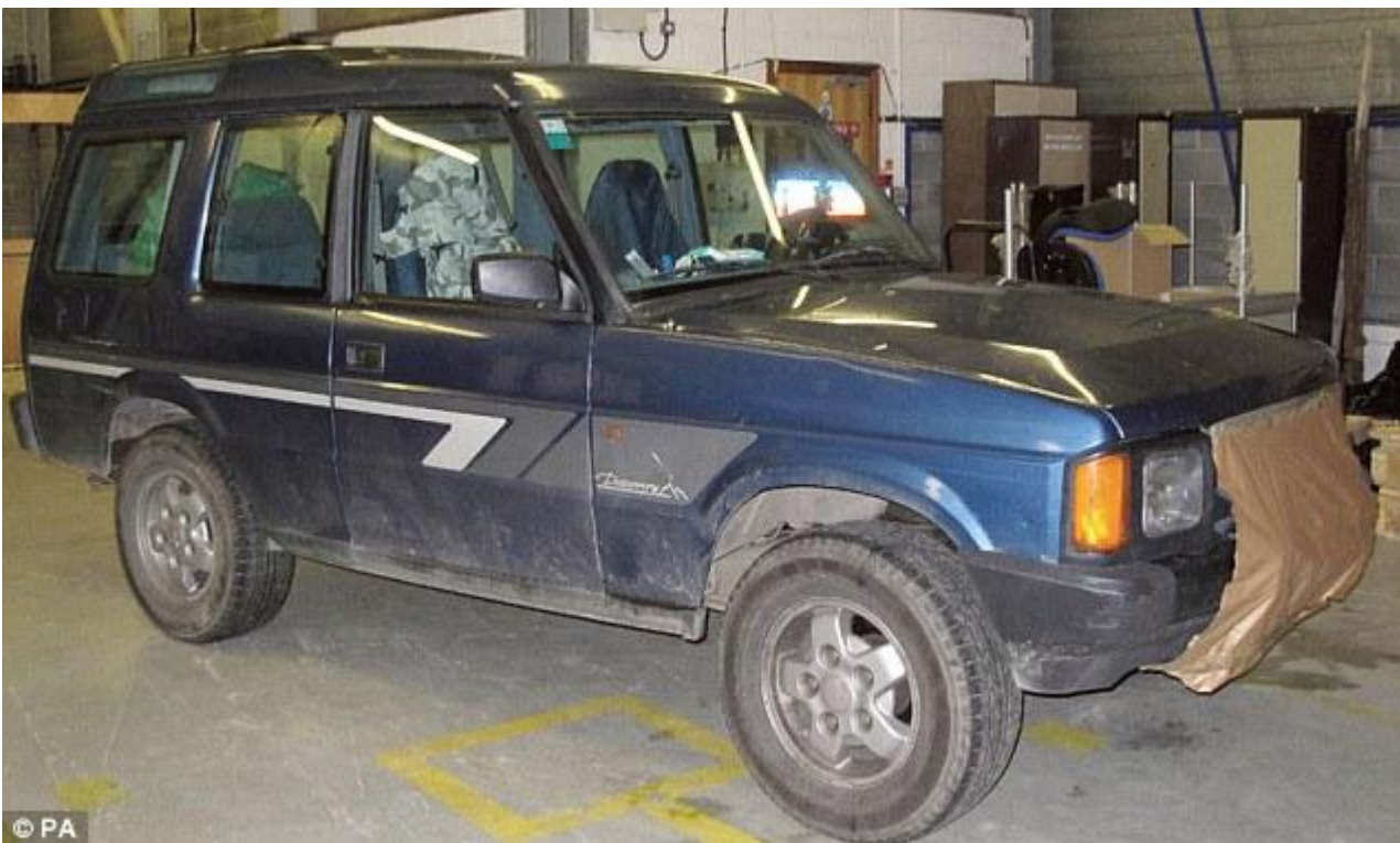
Evil: The jury saw images of Bridger's Land Rover Discovery heading away from town - April would already have been in the passenger seat after being abducted near her home