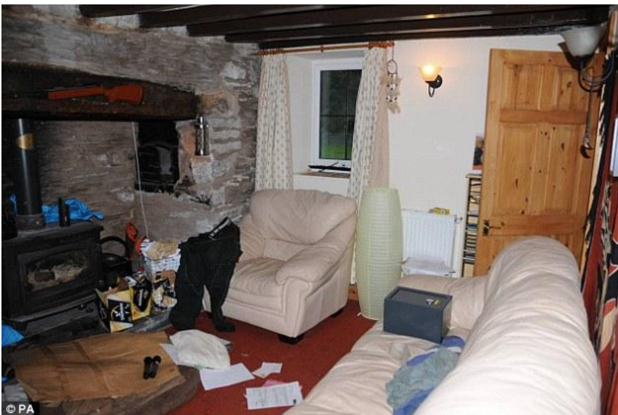
Lounge: This is Mark Bridger's living room, where forensics found blood and bone fragments, a room which was shown to jurors